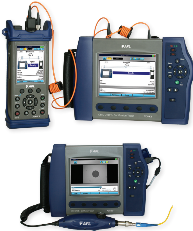
C860 with DFS1 Digital FiberScope